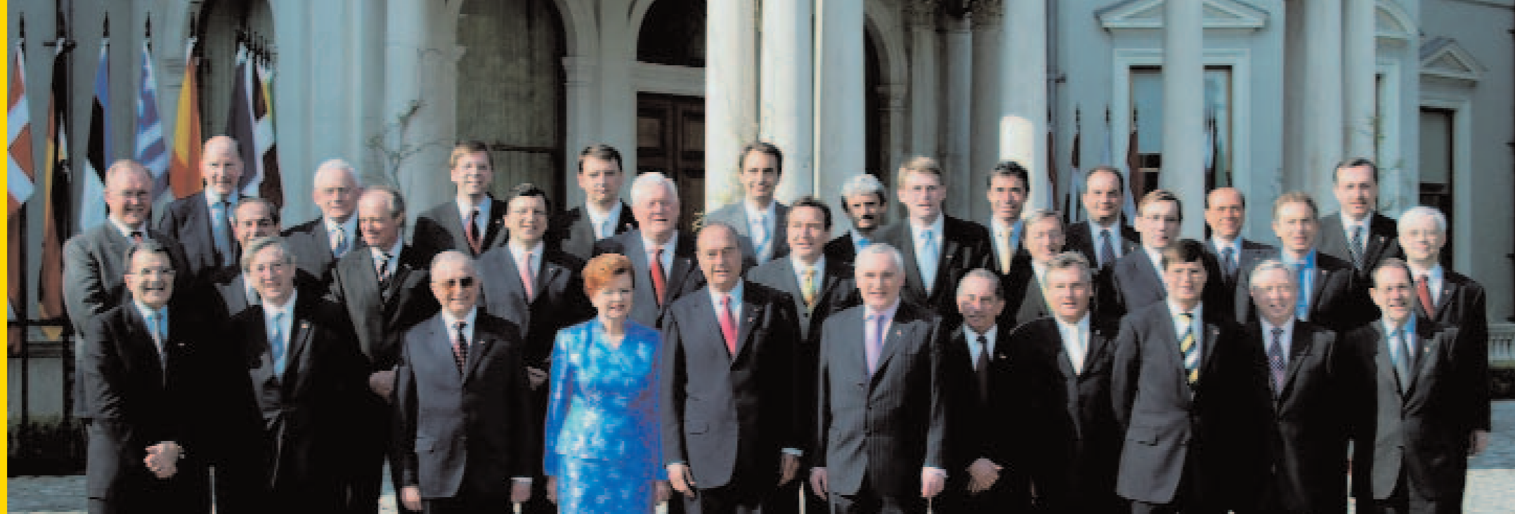
The EU Heads of State after EU Enlargement May 2004.