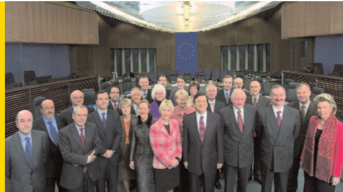
The Barroso Commission November 2004.