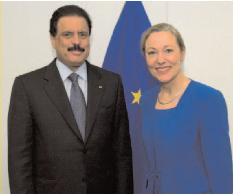
EU Commissioner for External Relations and the EU's Neighborhood Policy Benita Ferrero-Waldner meeting with GCC Secretary-General Abdulrahman Hamed Al-Attiah in March 2005.